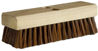
(HANDLE NOT INCLUDED)