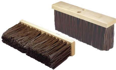
(HANDLE NOT INCLUDED)