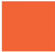
NEMO PNE LRV-37