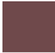
EARTHEN CLAY PEY LRV-41