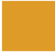
HONEY BEE PHY LRV-63