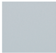
COOL GREY PCG LRV-38