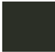
FLANNEL PFN LRV-2