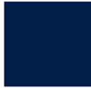
NORDIC PND LRV-10