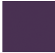
PURPLE HAZE PPH LRV-3