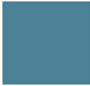
SURF'S UP PSP LRV-20