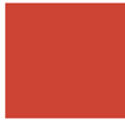
POPPY RED PPR LRV-22