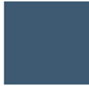
TWILIGHT SHADOW PTI LRV-59