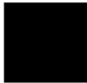
BLACK PBL LRV-1