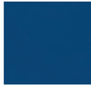
ULTRA BLUE PUB LRV-11