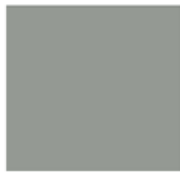
WARM GREY PWG LRV-26