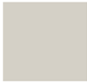
LIGHT TONE PLG LRV-65