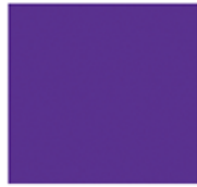
MARDI GRAS PMG LRV-9