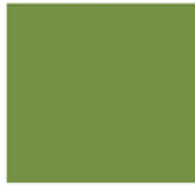
ZESTY LIME PZL LRV-32