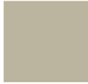
SAND PSA LRV-61