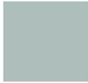
HAZY JADE PHJ LRV-42