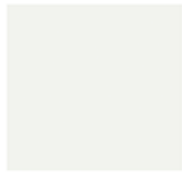
COTTONWOOD PCO LRV-86