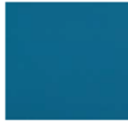
SKY BLUE PSK LRV-13