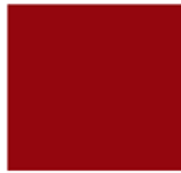
CAYENNE PCY LRV-12