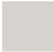
PEWTER TRANSLUCENT PPT LRV-26