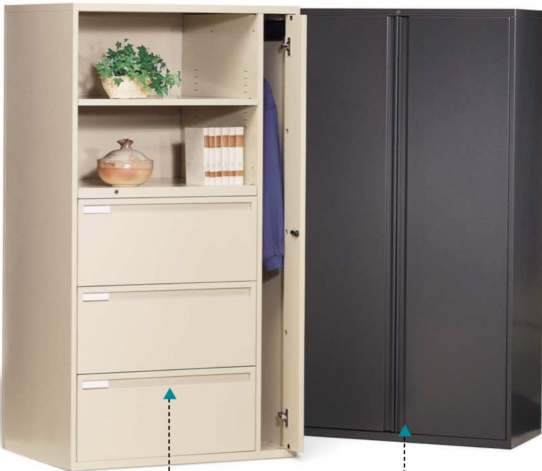
Kiosk's full-width finger pulls afford convenient access from any position.