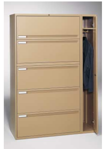
The steel kiosk add-on wardrobe is 9" wide, 18" deep, and 65-9/32" high to match a five high Series XXI lateral file.