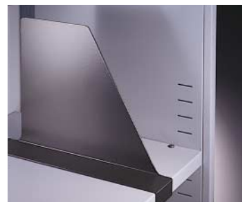
Book end supports move across the width of the shelf, accommodating the user's needs accordingly. The supports are available in a dark tone finish.