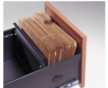
User-friendly compressor followers adjust by pulling up and moving forward or backward, in 1" increments, accommodating most filing needs.