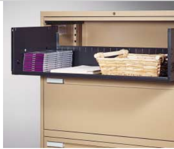
Rollout shelves allow for easy access to internal contents.