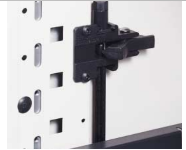
Laterals feature the Series XXI patented interlock. The interlock promotes safety by preventing more than one drawer from opening at a time. By automatically restaging, the interlock also prevents damage to the system if the drawers are removed and reinstalled.