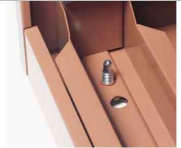
Glides that adjust from inside the cabinet make installation even easier.