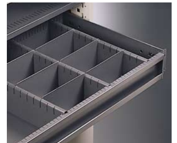
Series XXI addresses the needs of the 21st century office employee with its media drawers. Users can configure 6" drawer interiors to hold diskettes, video tapes, stationery, and more.