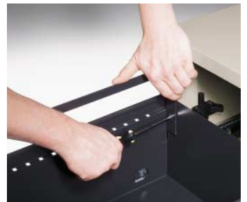
Hanging file storage is easily managed with field-installable folder bars. Pre-drilled holes at the rear of the file allow for bars to be quickly positioned with a Phillips head screwdriver.