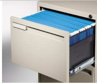
Legal-sized vertical file cabinets are 18" wide.