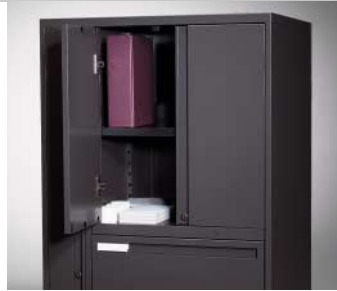
Shelving options include the kiosk with hinged doors and the kiosk with open bookshelf.