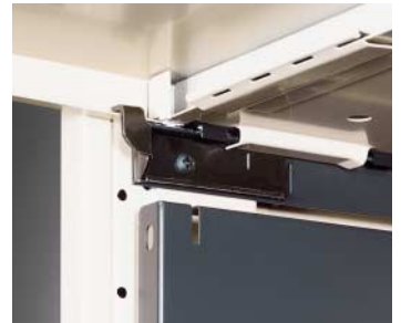
The Series XXI receding door mechanism's nylon glides prevent metal-to-metal contact, allowing smooth motion. The mechanism also features integral brackets that control outward movement and prevent doors from lifting out of the tracks and scraping on components above.