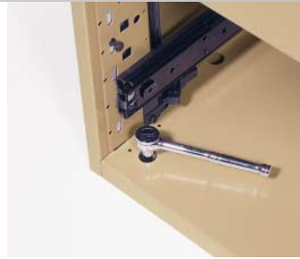
Use a 1/4" socket wrench to adjust glides from inside. The glides allow adjusting from inside or outside and allow accurate leveling of the cabinet.